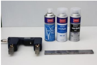
Testing Equipment & Magnetic particle detector