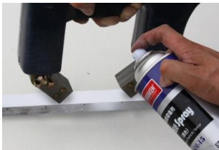
3. Forming the magnetizing current magnetic field