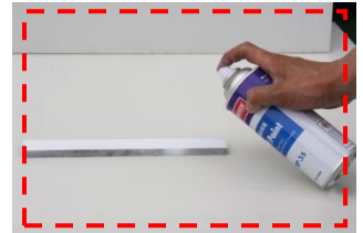
2. Spray MP-35 (White detector)