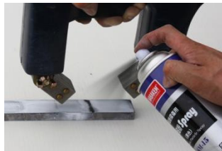
4. Spray SM-15 (black Magnetic particle detector)