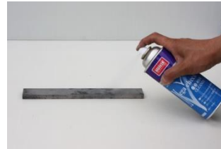
1. Cleaning of Testing Object